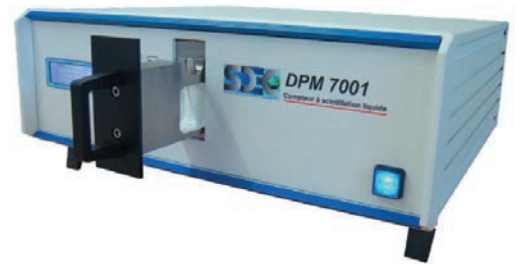
DPM7001, with flask holder open